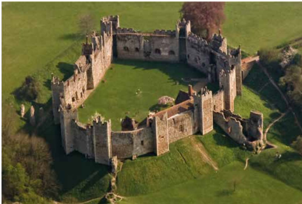
An aerial photograph of the remains of Framlingham Castle.